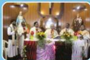
Etah Church remembers St. F. Xavier