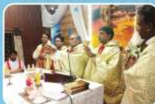
Golden Year begins in Hathras