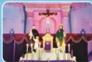
Advent begins at St. Patrick's, Agra