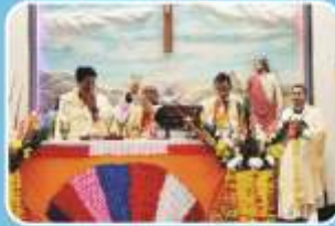
MVP celebrates Patron's Day