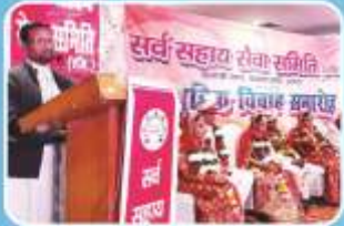
Catholic Priest blesses Hindu Samuhik Vivah