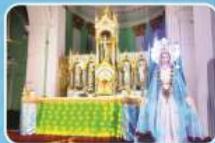
Solemnity of Imm. Conception, Cathedral