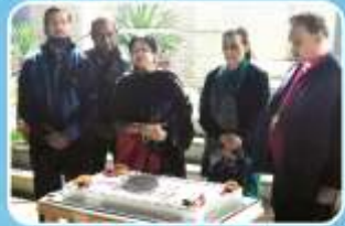
CNI marks ST' Day