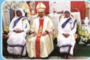
Jubilation at MC Convents Aligarh & Agra