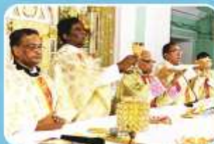
Solemnity of Christ The King, Cathedral