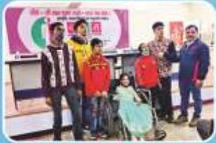
Alphonsians make a difference