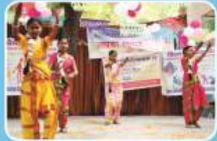
ACDSSS organises Street Plays, World Aids' Day & World Disabled Day