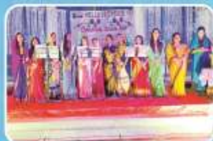
Carol Singing, Havelock Church, Agra Cantt